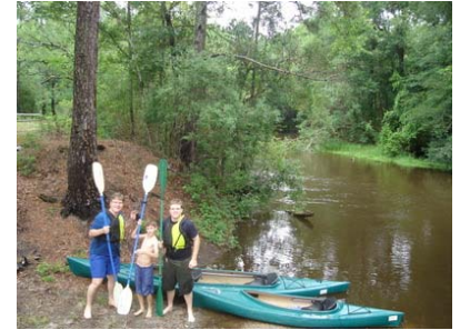
Lumber River, Robeson County

To ensure the LandDesign team’s findings reflect the realities of the region and are consistent with the vision and goals of the community, the team met with a committee of technical advisors on several occasions. The technical advisory committee is primarily composed of planning staff from the 11-county region and representatives from regional planning organizations including the Regional Land Use Advisory Commission (RLUAC) and the Department of Commerce Division of Community Planning.