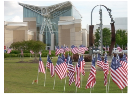
Airborne and Special Operations Museum, Cumberland County

Data Inventory Market Assessment Green Infrastructure Element Land Use Model (INDEX)