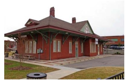
Sanford, Lee County