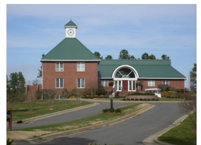
Anderson Creek Golf Club, Harnett County