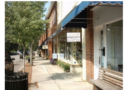
Southern Pines, Moore County